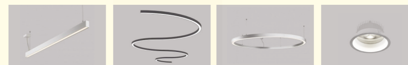
Lina45 Flumo60-S Rotao60 Ture